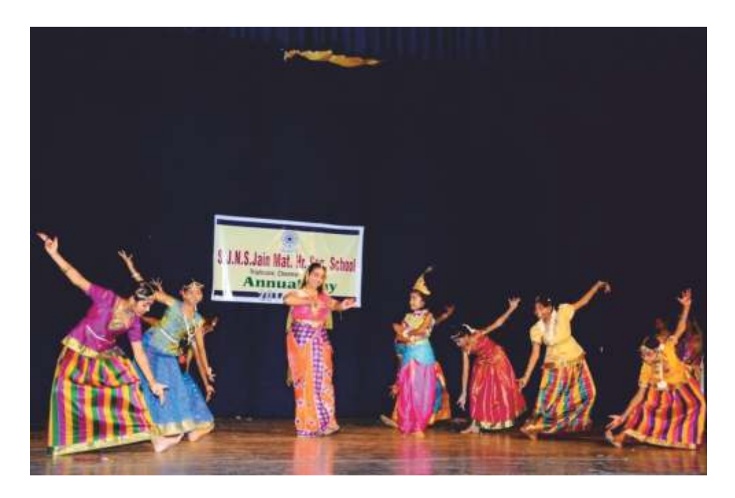
SJNS JAIN VID MAT HR SEC SCHOOL CULTURAL PROGRAM

Started as a primary school in the Matriculation stream with eleven students in 1984, the other units were subsequently added to meet the increasing demands from parents. The modest fees, dedicated teachers and good infrastructure attract students from all sections of society.