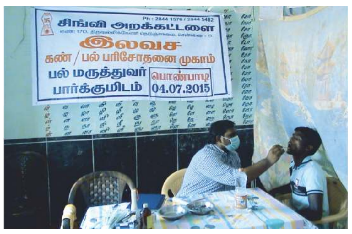
Dental check up done at camp held at Ponpadi