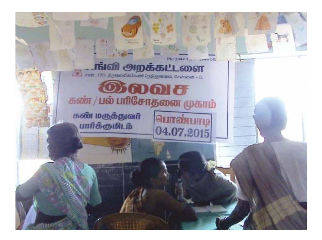
Free Eye check up done at Ponpadi on 4.7.15

During the period 1994 till date spectacles distributed free of cost by the Trust have enabled about 2.5 lacs people to have a better vision. The expenditures in running the camps including the free supply of spectacles and medicines amounts to nearly Rs.4.5 crores.