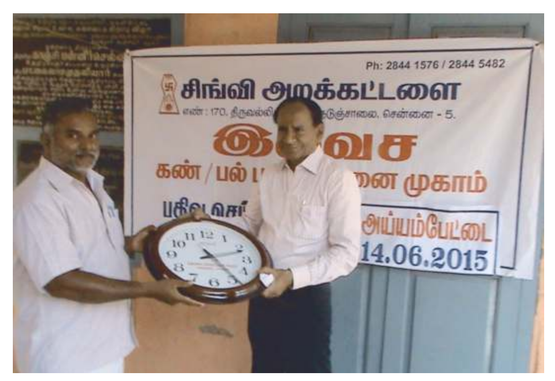
The Singhvi Charitable Trust presents a memento to one of the schools where a camp was held